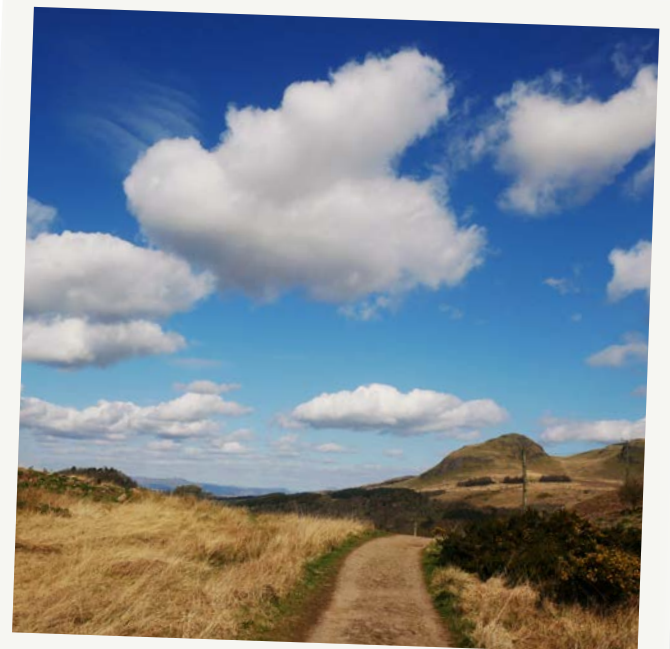
Descent to Dumgoyne

This is a route for the more experienced rider as there are steep gradients and rough ground to cover.