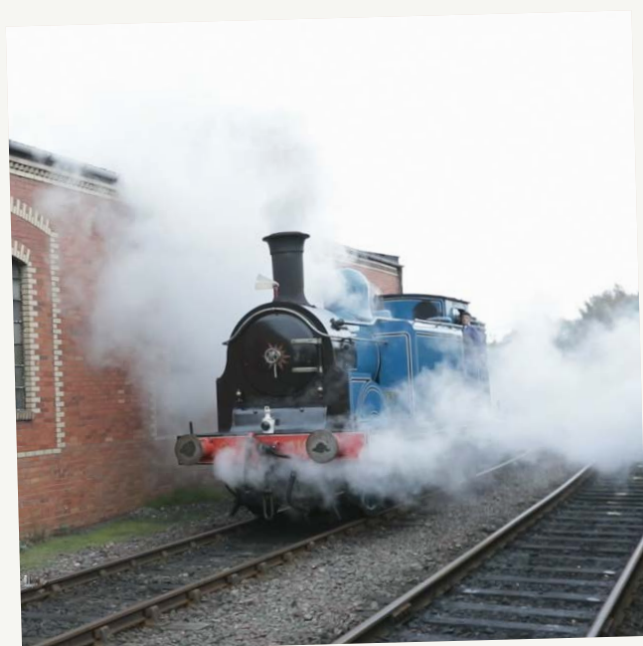
Bo'ness &amp; Kinneil Railway

Take a step back in time with a ride on a steam train and learn all about the history of rail travel at the museum and visitor centre.