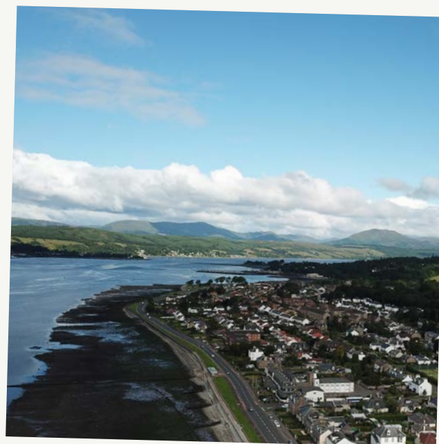
Gareloch from Helensburgh

Turning left along the footpath out of the Hill House car park, you'll follow a wooded path until the junction with the old 'Highlandman's Road' track. This descends towards Rhu and Pier Road brings you to the coast at the marina. From there it's a flat stroll along the coast back to Helensburgh along the promenade, where you can take in the views across the Firth of Clyde.