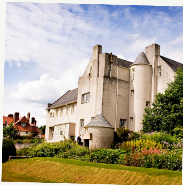
The Hill House