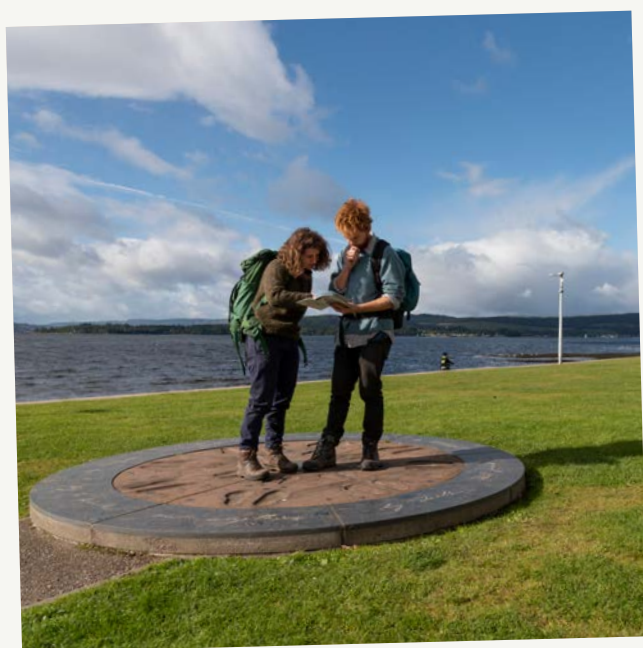
Route Start – Helensburgh Waterfront

Explore Charles Rennie Mackintosh's finest domestic creation, currently housed inside a protective 'box'. Go on a tour inside and out (even over the roof) and relax in the café.