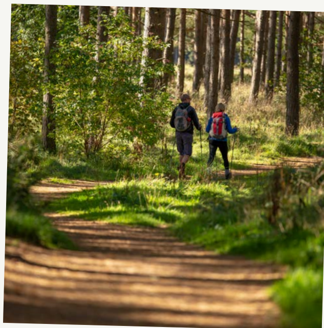
John Muir Country Park