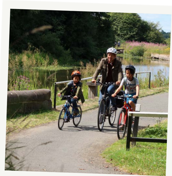
Forth & Clyde Canal

You'll find a range of facilities along the way including bike hire and food at Auchinstarry Marina as well as eateries in Kilsyth and Colzium.