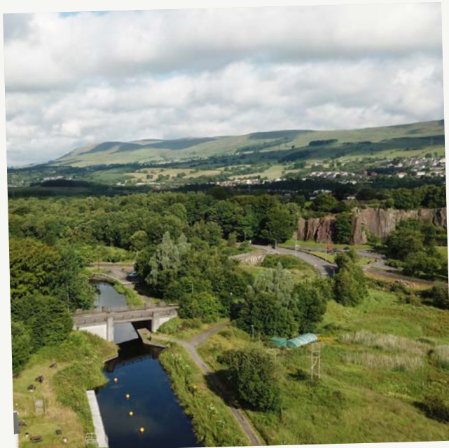
Auchinstarry & The Campsie Fells

This local nature reserve features ponds and grassland and is now home to many grassland birds, including lapwing and skylarks, and the water rail.