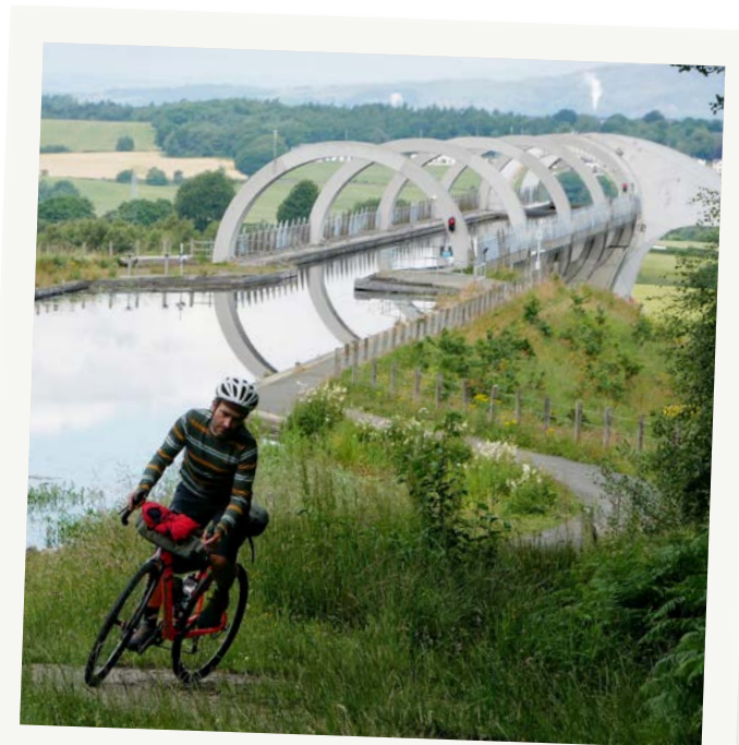
Leaving the Falkirk Wheel

Running mostly on traffic-free paths and tracks, the route has only one very short, lightlytrafficked on-road section. However, please note, there are several road crossings and some sections where shared-use paths next to busy roads are used to link the route.