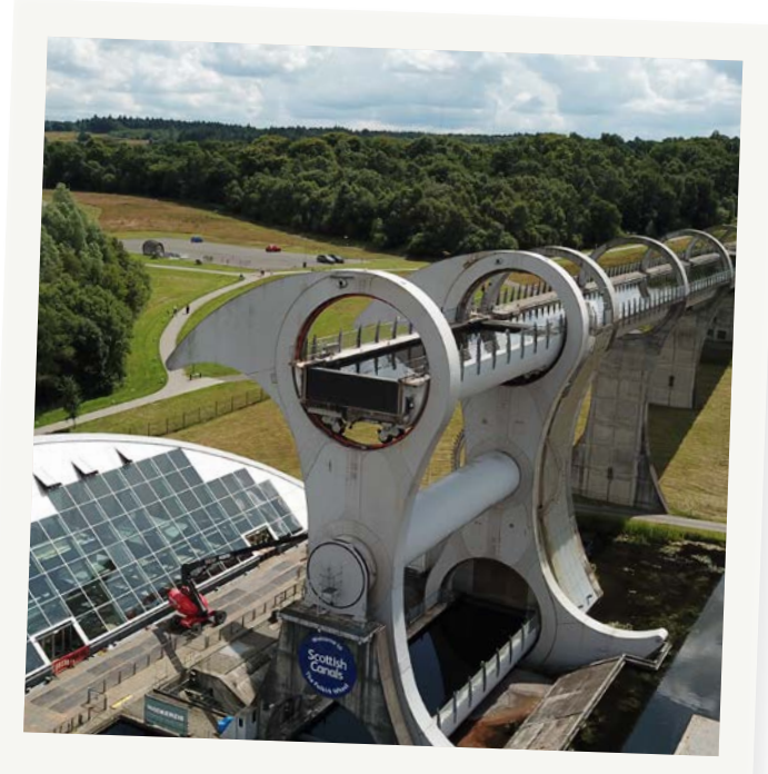
The Falkirk Wheel

For a slightly different route back to the Wheel, when you reach the canal again, turn left and follow the towpath through Roughcastle Tunnel.